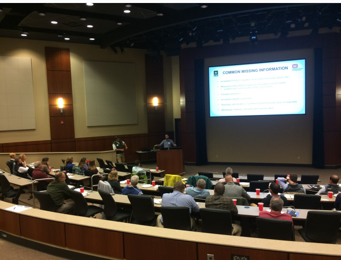
November 2019, inaugural meeting with the U.S. Army Corps of Engineers