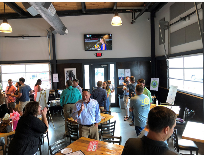
July 2021, happy hour at Steel Hands Brewery in Cayce