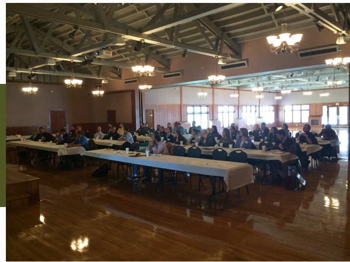
February 2020, second meeting with presentation by the American Mitigation Company